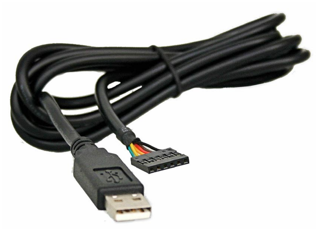
Figure 1 - The TTL-232R-3V3 USB to TTL Serial Converter Cable.